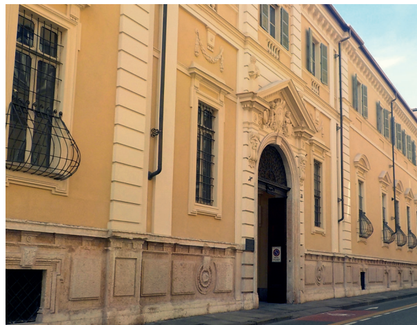
Palazzo d'Azeglio Via Principe Amedeo, 34 - Torino

Palazzo d'Azeglio is a historic building located in the center of Turin, it has been the headquarters of the Turin Humanities Programme - THP - of Fondazione 1563 since 2021. Its history began in 1679, when it was built as part of the second expansion of the city. It was the residence of local noble families, including the Taparelli d'Azeglio, hence the name. Since 1970 it has housed the Luigi Einaudi Foundation, a national point of reference for the social sciences.